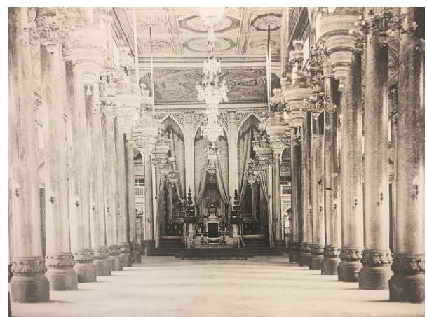
Figure 1. Example of Thai traditional style with Western influence in Ananta Samakom Throne Hall.

Teak wood was often used to make furniture such as thrones, mirror frames, cupboards, sofa beds, beds, and drawers, which tended to be accompanied by many elaborated carving patterns and gold leaves to reflect the identity and ranks of the owners. Interior walls and ceilings were decorated with fresco and mural paintings in colors. A further example can be seen in Figure 2 of Vimanmek Mansion Year of Completion, 1901 in Bangkok.