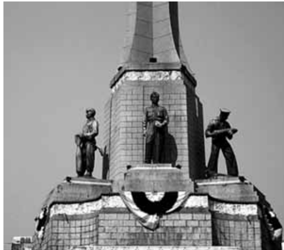
Figure 5. The Victory Monument, Bangkok, Thailand, designed by M. L. Pum Malakul.