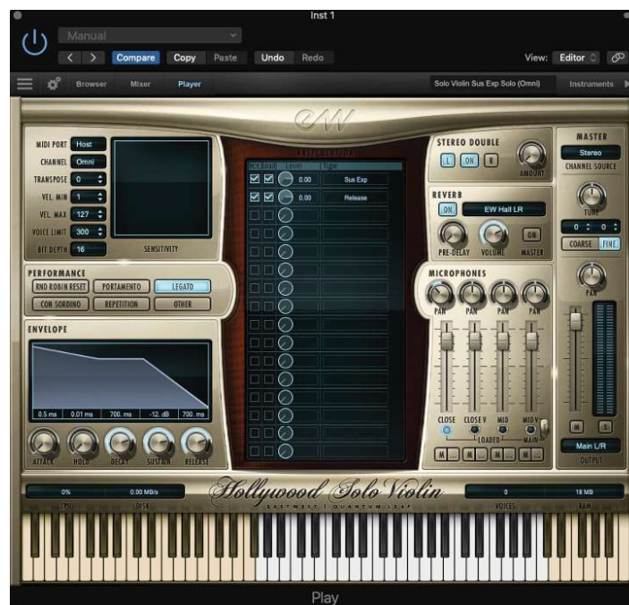
Figure 4. Basic PLAY interface in Logic Pro X

Third party sound patch can offer greater sound than built-in sound patch. In case of symphony orchestra, there are many software companies offering sound patches to be used as DAW or as plug-in for DAW. EastWest Quantum Leap or EWQL is one of companies that offer plug-in virtual orchestra. The plug-in requires PLAY in order to use the sound from the plug-in.