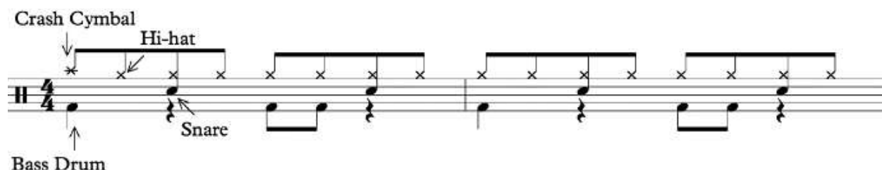
Figure 2. Basic drum pattern

In case of drum set, a Logic Pro drum set is based on a standard drum set which consists of 1 bass drum, 1 snare, 2 tom-toms, 1 floor tom, 1 hi-hat, 1 ride cymbal, and 1 or 2 crash cymbals. It is up to the composer/songwriter to choose the right drum set. Each drum set contains different sounds, attack, and reverb that are pre-set for immediate usage in which can be further adjusted to suit the preference of the user.