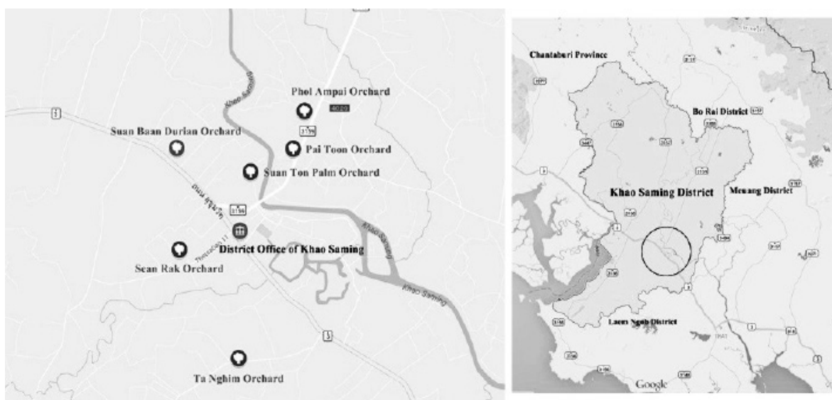
Figure 1 Map showing the location of the sampled tourist orchards in Khao Saming district

This study focused on the characteristics, multifunctionality, and values of tourist orchards in Trat Province. Hence, tourist orchards which participated and were promoted by the Tourism Authority of Thailand under the theme “Travel Every Orchard and Test it” constitute population of this study. Six farmers/owners in Khao Saming District and three farmers /owners in Koh Chang District, Trat Province were interviewed as samples (Figure 1 and 2).