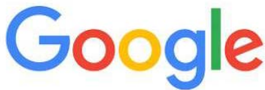
Figure 8 Wikipedia, Google

5. A network that connects between users (Peer to Peer: P2P) is an online social network of direct connections between users thus causing communication or sharing of information quickly and directly to users. These types of social networking service providers are Skype and BitTorrent. Examples are shown in Figure 9.