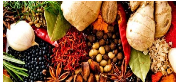
Figure 1 Various pharmaceutical materials from plants, animals and minerals that are used to make medicines.

medicine methods. One of the outstanding aspects of Thai traditional medicine is to take care of mother's health after giving birth, such as staying on fire, over a salt pot, sitting on charcoal, taking a herbal bath, and herbal steaming.