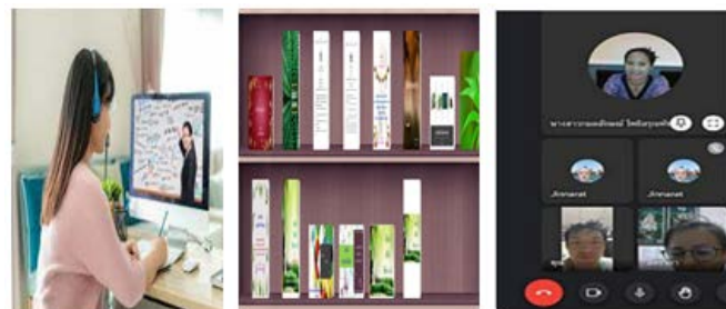
Figure 3 Innovation in learning Thai traditional medicine based on a new way of life

In the 21st century that has developed people to be more quality than producing people as economic raw materials, it can be said that society must see the meaning of the new way of life in a broader picture as a tool for restructuring the economy and society to create quality and well-being people that balance social change. able to solve social problems will lead to reduction of inequality, making the new way of life base more than education and in accordance with the learning of midwifery based on a new way of life, which is different from that in many Thai traditional medicine textbooks [9] which has been rewritten according to the knowledge of modern people and is used today as shown in Figure 3.