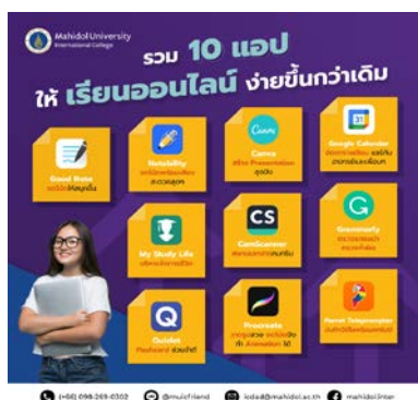
Figure 5 An application that helps in online learning

1. Create and announce identity (Identity Network), this type of social network is used for giving visitors a space to create an identity on the website and be able to publish their stories through the Internet by the nature of the dissemination may be pictures, videos, text writing on blogs. It is also a website that focuses on finding new friends or searching for old friends who lost contact. An example is shown in Figure 5.