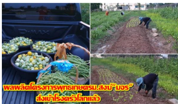
Figure 2 Growing non-toxic vegetables to reduce costs, with the goal of not less than 500-1000 university students who come to study at the university in early 2019