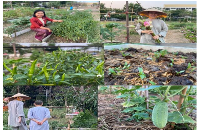
Figure 5 Vegetables garden at the student dormitory building in MCU about 0.5 Hecter for research and model of sustenance food production under to concept of "Balance" (4 April 2020)

production at Buddhist University is a mechanism and one model of creating a balance that appears in Buddhist University at Phra Nakhon Si Ayutthaya province as well.