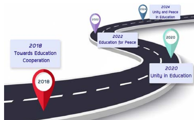
Figure 3 ASEAN Education Roadmap 2018-2024

The scenario was shown in ASEAN education roadmap to predict the future of education that to move towards education cooperation in 2018, to be a unity in education in 2020, to have education for peace in 2022, and to make ASEAN community full of unity and peace of education in 2024 as below figure..