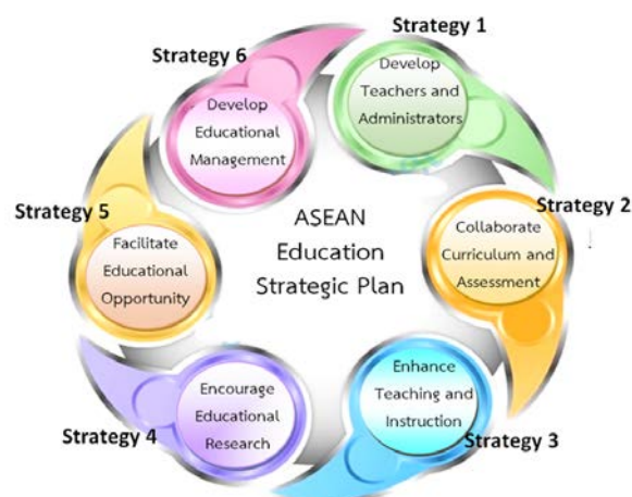
Figure 1 ASEAN Education Strategic Plan

For the strategy of educational management for peace in ASEAN community, it indicated that six strategic aspects were synthesized consisted of strategy 1 is to develop teachers and administrators, strategy 2 is to collaborate curriculum and assessment, Strategy 3 enhance teaching and instruction, strategy 4 is to encourage educational research, strategy 5 is to facilitate educational opportunity, and strategy 6 is to develop educational management and showed as below figure.