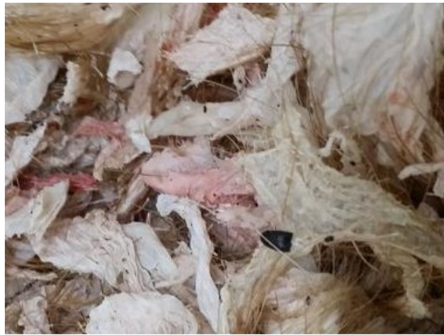
Figure 4 Waste of pig's hair received from grilled swine production

For the storage method, as grilled swine is freshly made, it cannot be kept for a long period of time as oily fat will easily cause rancid to the menu. Due to the limited production period of 2–3 hours and the tight selling time of 3–4 hours only, grilled swine is best to be consumed within a few hours after it is fully grilled or store it in the fridge. This is an inferior characteristic of grilled swine comparing to other low-fat food menus.