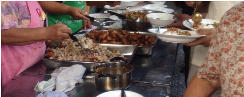
Figure 2 Local consumption style of grilled swine

Generally, a range of problems can be found in production cost, marketing and manufacturing knowledge. Production cost is directly affected by the fluctuation of piglet prices, but the selling prices of grilled swine cannot be increased according to the rising production cost. As a result, it is best to manufacture grilled swine at a certain amount expected to be sold out on a daily basis only. For distribution channel, quality and manufacturing knowledge of grilled swine, major problems arise from the lack of technological progress, such as the use of the Internet, required for greater marketing efficiency. Admittedly, manufacturers and entrepreneurs of grilled swine are incapable of applying proficient knowledge in improving the quality of grilled swine as almost all of them are determined to rely mainly on their local wisdom and knowledge inherited from their parents and previous generations.