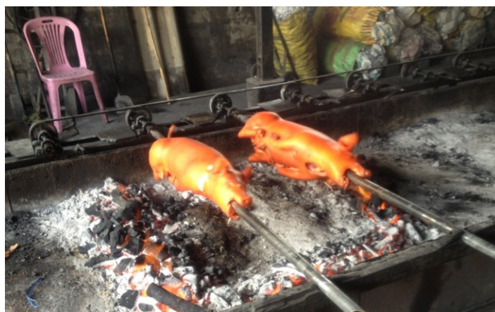
Figure 3 Grilled swine manufacturing

It is required to generate a relatively huge investment of around 5,000–10,000 baht in preparing tools and equipment required for the manufacturing of grilled swine. As the production of grilled swine, basically conducted in a house, requires the charcoal-grilling heat of 700–800 °C, the production area is unavoidably damaged by burned spots. Basically, grilled swine requires at least 3 hours in manufacturing and burned spots are something unavoidable (Figure 3). This is considered as one of the major reasons that hinder new entrepreneurs from entering into the business.