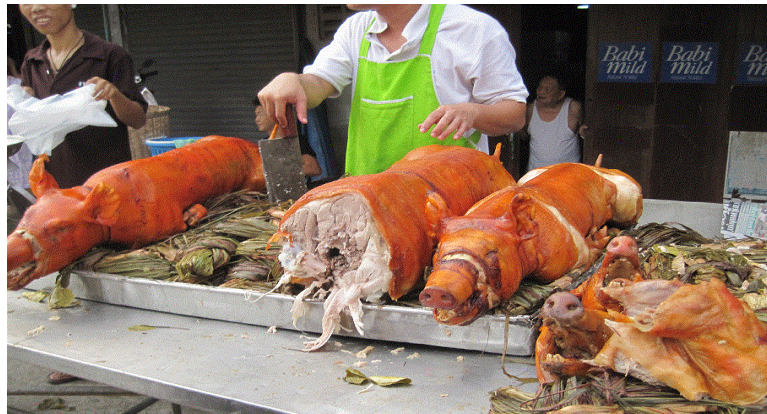
Figure 1 Grilled swine business in Tha-Kham sub-district, Samphran district, Nakhon Pathom province

Generally, a range of problems can be found in production cost, marketing and manufacturing knowledge. Production cost is directly affected by the fluctuation of piglet prices, but the selling prices of grilled swine cannot be increased according to the rising production cost. As a result, it is best to manufacture grilled swine at a certain amount expected to be sold out on a daily basis only. For distribution channel, quality and manufacturing knowledge of grilled swine, major problems arise from the lack of technological progress, such as the use of the Internet, required for greater marketing efficiency. Admittedly, manufacturers and entrepreneurs of grilled swine are incapable of applying proficient knowledge in improving the quality of grilled swine as almost all of them are determined to rely mainly on their local wisdom and knowledge inherited from their parents and previous generations.