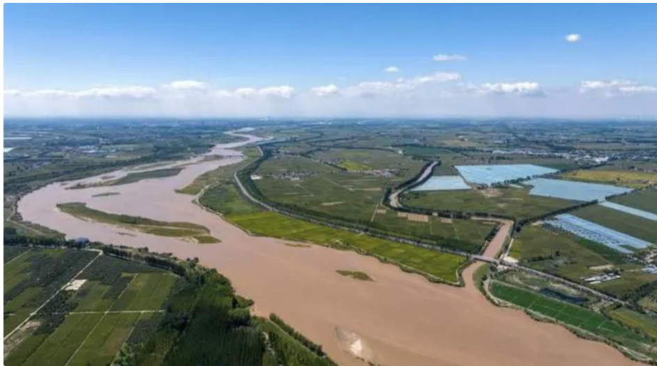
Picture 1 : August 26 The Yellow River taken in Yongning County, Yinchuan City, Ningxia (drone photo)

The Yellow River, the mother river of Chinese civilization, has nourished China's agricultural civilization for thousands of years with its fertile soil and abundant water. This ancient river is not only a gift of water, it has also nurtured a profound and unique culture, the Yellow River Culture, which is a brilliant treasure of Chinese civilization. The Yellow River culture has been precipitated and enriched through the ages, and has had an indelible influence on China's social structure, cultural concepts and artistic creation. In the following discussion, we will dig deep into the roots of the Yellow River Culture, trace its extensive imprints in the social, cultural and artistic fields, and think about how to skillfully pass on and innovate this valuable cultural heritage in the modern society. First of all, let us delve into the origin and development of the Yellow River Culture.