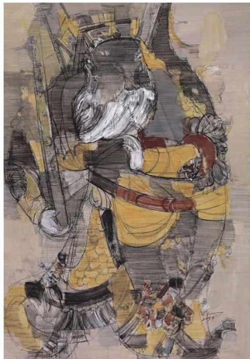
Picture 4: Gu Liming Door God - Yellow No.2 oil on canvas 164cm×114cm 2009

work reflects Gu Liming's profound exploration of materials and forms. He uses a variety of materials such as charcoal, waxed paper, acrylic and resin glue, the combination of which not only provides the work with rich visual effects, but also adds a sense of historical traces, demonstrating the reinterpretation of traditional cultural symbols by modern artistic means. Secondly, the compositions and brushstrokes in the works emphasize the tone of "plainness", i.e., through simplification and abstraction, the specific details of the traditional symbols are stripped away, leaving behind the core elements with more symbolic meanings. Gu Liming's dynamic lines and flowing forms not only give the work a sense of movement, but also lend a modern, abstract aesthetic to the traditional image of the door god. Gu Liming's work is not only an artistic re-creation of the traditional image of the door god, but also a profound demonstration of the reinterpretation of traditional cultural symbols in a modern context. Through this work, he demonstrates how traditional Chinese cultural symbols can be expressed through modern artistic means and materials, so that they can take on a new light and vitality in the context of globalized art.