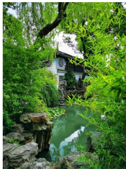
Figure 4 Canglang Pavilion