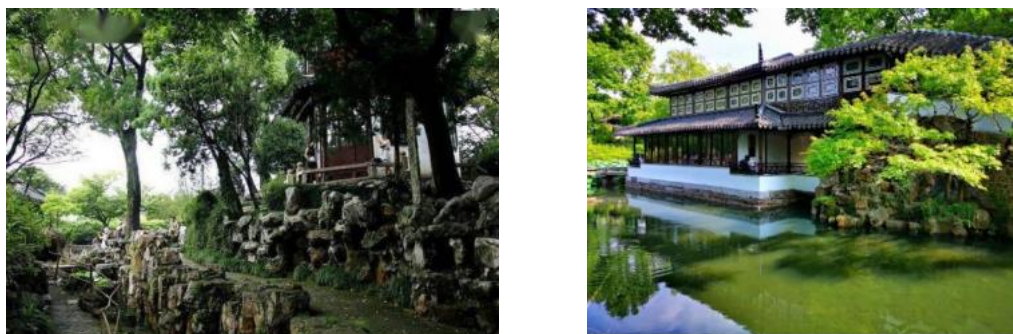
Figure 2 The Humble Administrator's Garden

Taoism stresses the importance of following nature and the trend, and pursues a lifestyle of doing nothing. Suzhou's classical gardens often utilize "landscape mood" in their design and construction, creating an atmosphere of transcendence that allows people to relax and soothe their minds and bodies. Elements such as landscapes, stone paths and rockeries in the gardens all reflect the Taoist philosophy of doing nothing, bringing people a sense of beauty and inner peace that transcends utilitarianism.