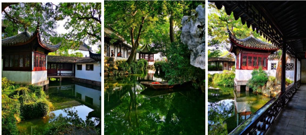
Figure 3 The Humble Administrator's Garden, The Humble Administrator's Garden in Suzhou, Jiangsu

The spiritual and cultural ecology of Suzhou's classical gardens embodies the core concept of Confucianism, namely, "cultivating one's moral character and aligning one's family, ruling the country and leveling the world". As a cultural carrier, the garden is not only a recreation of natural landscape, but also a product of the integration of culture and nature. In the process of construction and management of gardens, traditional virtues such as benevolence, courtesy and music, and the middle way in Confucianism are inherited and promoted, and people's sentiments and moral cultivation are cultivated. At the same time, the gardens also provide an ideal humanistic environment in which people can perceive the true meaning of life, seek inner peace and satisfaction, and feel the traditional virtues of benevolence, courtesy and music, and the way of mediocrity advocated by Confucianism, so as to enhance their own cultivation and realize the restoration and perfection of human nature.