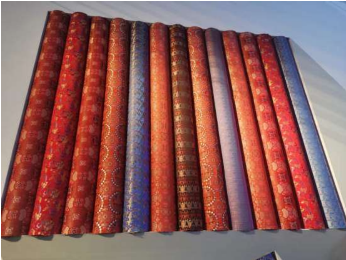
Figure 1 royal court attire

In summary, Shu Brocade stands as a testament to the rich cultural heritage of China, showcasing its artistic excellence and cultural identity. This research endeavors to explore the aesthetic innovation and cultural inheritance of Shu Brocade, examining its evolution and adaptation in the face of changing societal dynamics. By doing so, it aims to highlight the dynamic nature and enduring relevance of Shu Brocade in contemporary society, as it continues to inspire and captivate individuals across generations.