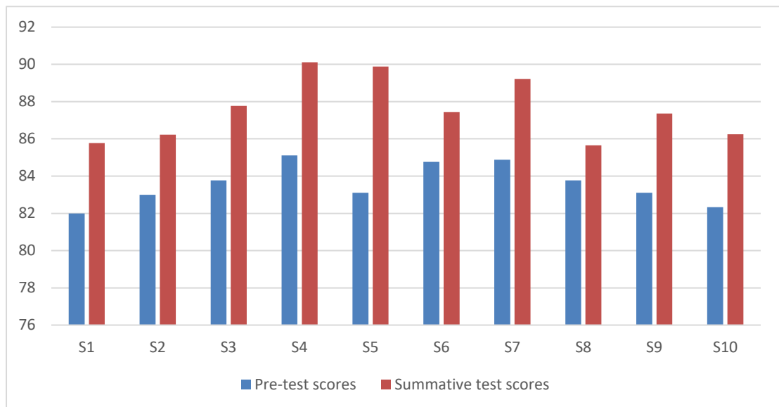
Figure 2 Pre-test and Summative test score analysis